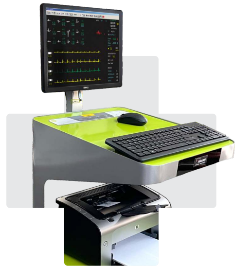
12 Lead mode with Superimposed Medians

*Due to our continuous product development program, the specifications may change without prior notice.